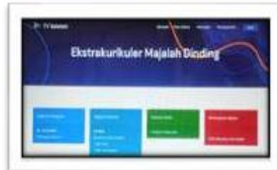
Figure 3. Display Virtual Class Figure 4. Display MD Extracurricular