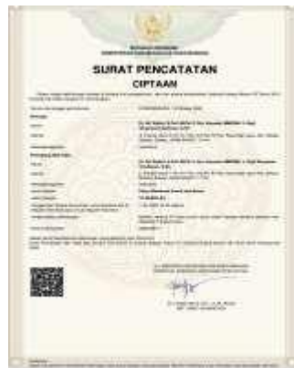
Figure 5. IPR Kemendiknas TV School

School TV potential tall For convey message interesting education interest and attention child. Importance broadcast educational TV School can made as one source learning (Rahmawati & Watini, 2022) For build quality broadcasting friendly television child, needed cooperation from various parties, incl government, KPI, station television, schools, parents and society general. However, with existence of school TV, this become solution best for children, because can used as a learning medium, place recreation, resources learning, and reinforcement character.