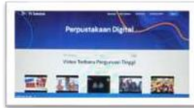
Figure 1. Display Stage School Figure 2. Display Digital Library