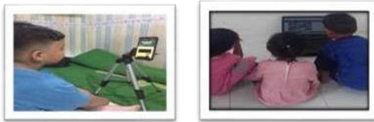
Figure 6. Medium child see question Stage School

teachers can develop ability children's digital literacy with give appropriate activities and stimuli in order to be able to maximizing Electronic media processing in children.